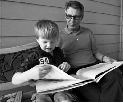
Read together regularly.

Children need to see you reading for a number of purposes: enjoyment, recipes, directions, and to answer questions. The same is true for writing. Be sure to talk about what you are doing, say "Let's read the directions to figure out how this works." "I think that I will write this down, so that I don't forget how to do it." Seeing adults who are important to them read and write speaks much louder than words that reading is valued.