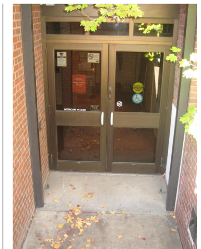
The library's ground level entrance has a convenient intercom and access to elevator.

The library staff wants you to know that access should never be a barrier to getting library services. You can phone in requests, use our access ramp (near the outside book return) and elevator, or use our web-based services. Patrons with access difficulties may apply to get books by mail on a temporary or permanent basis. We also have a group of screened volunteers who can do home visits to deliver or pickup books to Homebound patrons. We have audio books, large print, and videos too! Please call the library if you or a family member has been missing your library services!